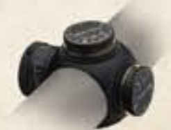
STANDARD VX-III 1/4 MIN CLICK DIAL