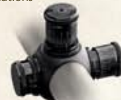
TARGET-STYLE ADJUSTMENT KNOBS

Adding target-style adjustment knobs to your scope is just one example of the adjustment dial options you have from the Leupold Custom Shop. We can install the dials of your choice in almost any Leupold scope (the LPS® and Rifleman™ models being the only exceptions). We can even change the dials of the VX-III Long Range M3 to those of the VX-III Long Range M1. You can have the elevation knob alone changed, or change both. The combinations are many, and the choice is all yours. Contact the Custom Shop for more information.