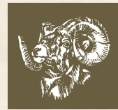
BIG HORN SHEEP

HERE'S A SET-UP THE MOST DISCRIMINATING ELK HUNTER WILL APPRECIATE. A CUSTOM-BUILT REMINGTON® 700 IS TOPPED OFF WITH A CUSTOM LEUPOLD VX-III 2.5-8X36MM SCOPE. THE SCOPE FEATURES A DISTINCTIVE LASER-ENGRAVED BULL AND BEAUTIFUL 18K GOLD PLATING ON THE RINGS. THE RIFLE IS CHAMBERED IN REMINGTON'S POPULAR .300 SHORT ACTION ULTRA MAG. (SAUM), DELIVERING ACCURACY AND PERFORMANCE GENERALLY RESERVED FOR LONG ACTION CALIBERS. TO LEARN MORE ABOUT OUR GOOD FRIENDS AT REMINGTON, VISIT WWW.REMINGTON.COM.