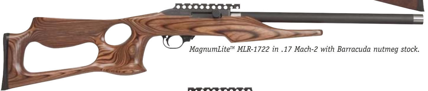
MagnumLite™ MLR-1722 in .17 Mach-2 with Barracuda nutmeg stock.