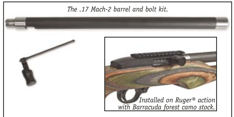
The .17 Mach-2 barrel and bolt kit.

You may also bring your existing Ruger® to the ultimate level of accuracy with our easily installed replacement graphite barrels. Or choose a complete rifle in .22WMR or .17HMR - these complete rifles include a Ruger® Winchester Magnum receiver our Magnum Lite graphite barrel and either a Hogue Over-Molded™ stock or a Barracuda competition stock in forest camo, nutmeg or a pepper laminate.