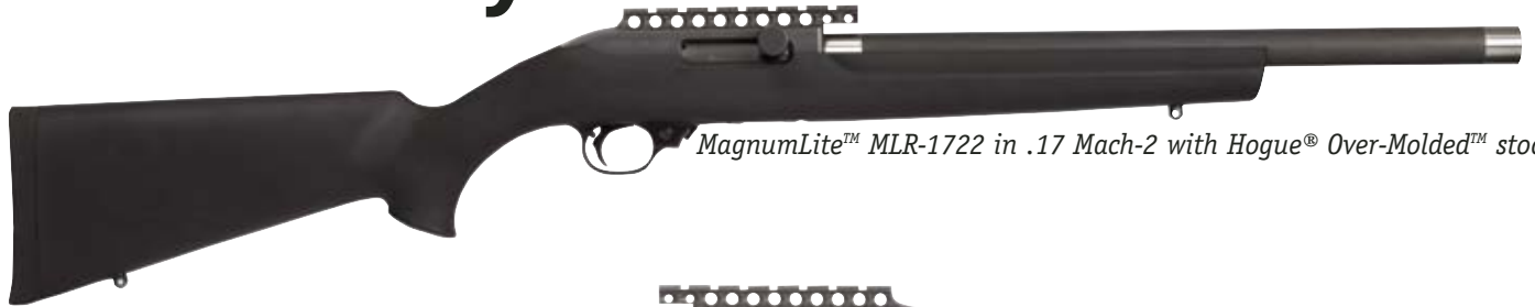
MagnumLite™ MLR-1722 in .17 Mach-2 with Hogue® Over-Molded™ stock.