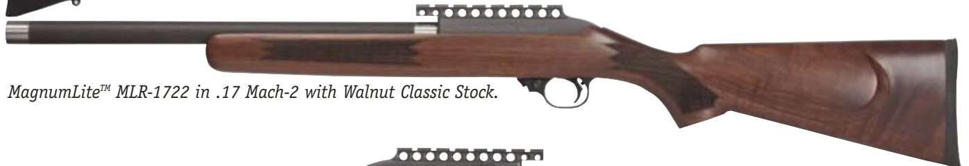
MagnumLite™ MLR-1722 in .17 Mach-2 with Walnut Classic Stock.